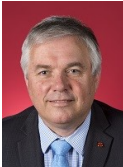
Senator Rex Patrick

They provide frontline services in the areas of climate change, domestic violence, homelessness, refugee issues and a vast range of other social issues—issues this government doesn't really care about. Charities have raised issues and continue to advocate on issues such as black deaths in custody and the end of gender-based violence.